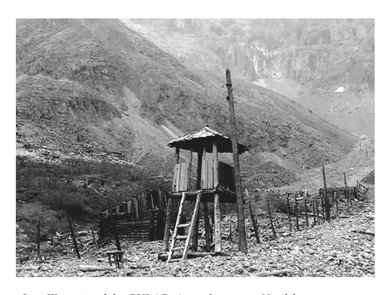
A scene from We survived the GULAG; A watch tower in Norilsk.