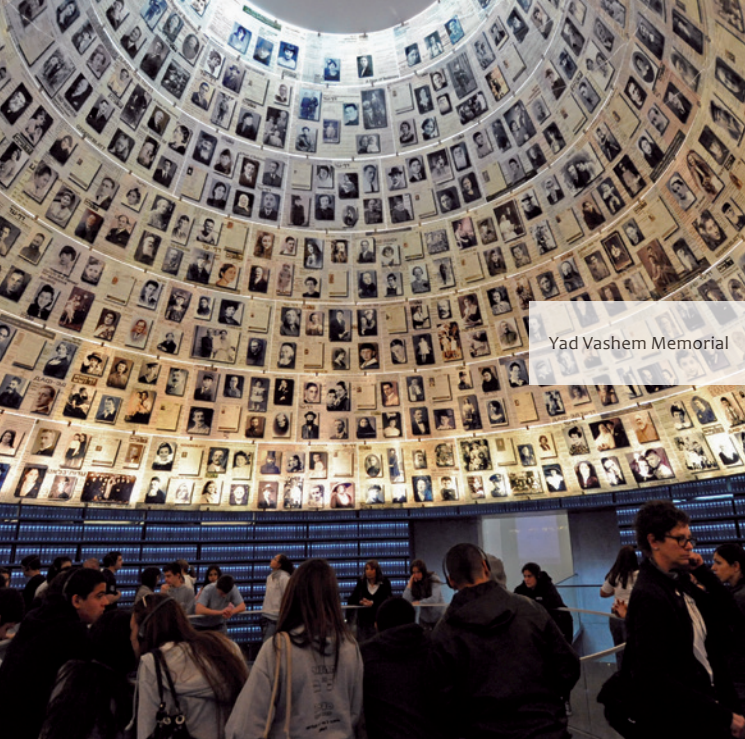
Yad Vashem Memorial

“And so we have to know these good people who helped Jews during the Holocaust. We have to learn from them and think of them in gratitude and hope.”