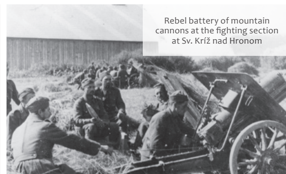
Rebel battery of mountain cannons at the fighting section at Sv. Kríž nad Hronom