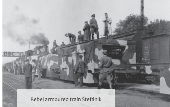
Rebel armoured train Štefánik