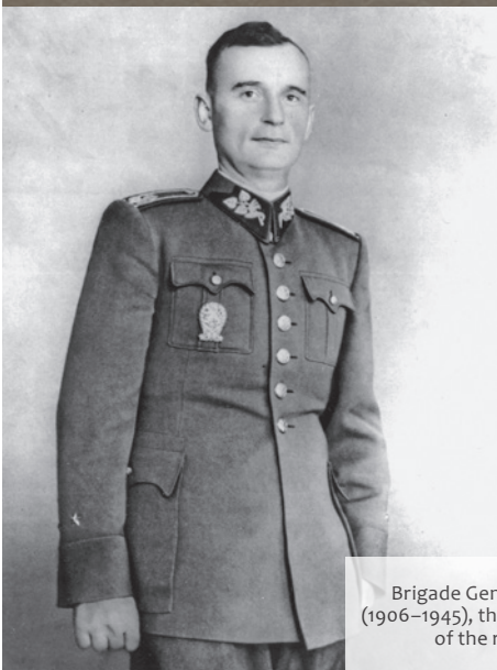
Brigade General Ján Golian (1906–1945), the first commander of the rebel army