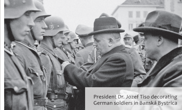
President Dr. Jozef Tiso decorating German soldiers in Banská Bystrica