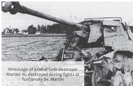
Wreckage of a rebel tank destroyer Marder III, destroyed during fights at Turčiansky Sv. Martin

“Slovakia primarily needed the uprising for its own sake. Even if the war end had been decided a hundred of times before (however, there were still eight bloody months until the end of fighting in Europe and until German capitulation), it was not decided what the position of Slovakia would be after the war, whether as a passive object decided upon by others, or whether it would show the world its own will, its own idea about its future, and its will to participate in the decision about its destiny.”