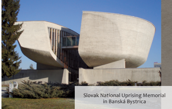
Slovak National Uprising Memorial in Banská Bystrica