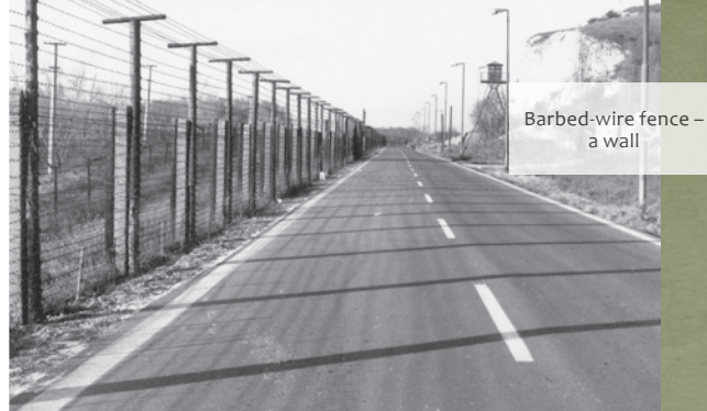
Barbed-wire fence – a wall