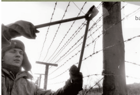
Dismantling of barbed-wire fences

“The result of the cold war was the same as in case of an armed conflict. The difference was in the fact that it was declared against citizens of their own state. The Iron Curtain became the front line; however, the enemy was missing on the other side.”