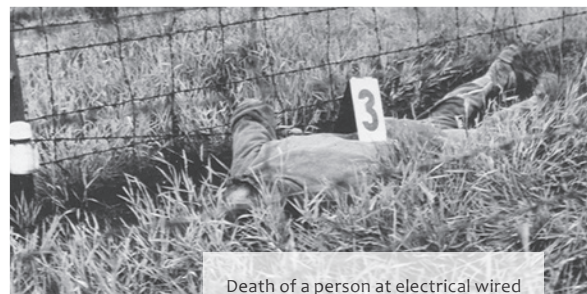
Death of a person at electrical wired barrier when attempting to cross the Iron Curtain

Crossing the strictly guarded border without the necessary documents was classified as an offence after the war ended. At the beginning of 1949, a system of obstacles that were hard to overcome started to be created at the border with the former occupation zones of Germany and Austria.