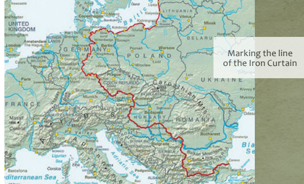
Marking the line of the Iron Curtain