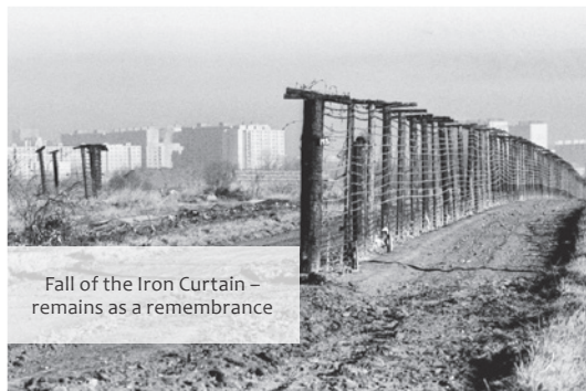
Fall of the Iron Curtain – remains as a remembrance