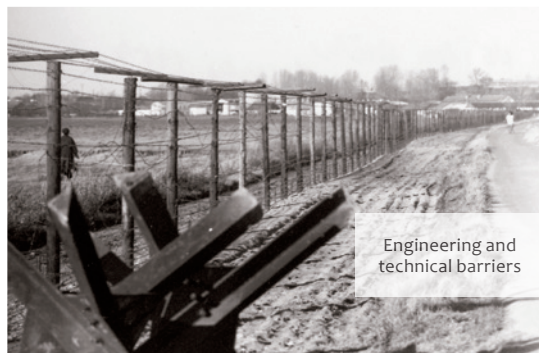
Engineering and technical barriers