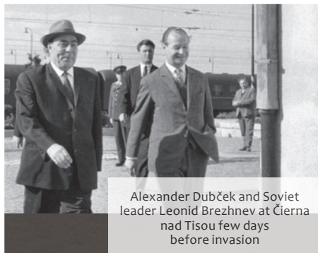
Alexander Dubček and Soviet leader Leonid Brezhnev at Čierna nad Tisou few days before invasion