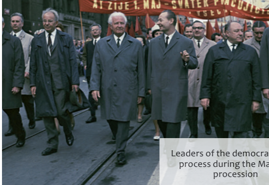
Leaders of the democratization process during the May Day procession