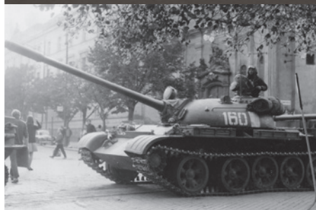
Occupation armies in Slovak cities