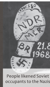
People likened Soviet occupants to the Nazis