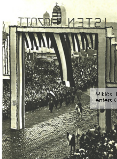
Miklós Horthy enters Košice