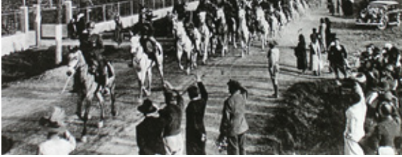
Entry of the Hungarian Red Army to Rimavská Sobota