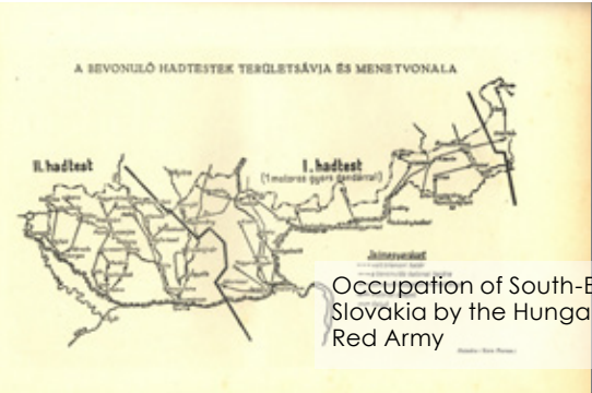
Occupation of South-Eastern Slovakia by the Hungarian Red Army