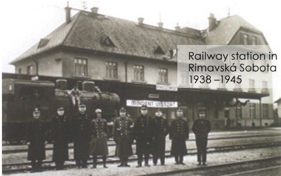
Railway station in Rimavská Sobota 1938–1945